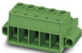
The figure shows a 5-pos. version of the product

PCB connector, nominal current: 76 A, number of positions: 9, pitch: 10.16 mm, connection method: Screw connection with tension sleeve, color: gray, contact surface: Silver