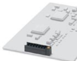
PCB headers, number of positions: 6, pitch: 3.5 mm, color: green, contact surface: Tin

Please be informed that the data shown in this PDF Document is generated from our Online Catalog. Please find the complete data in the user's documentation. Our General Terms of Use for Downloads are valid ( http://phoenixcontact.com/download )