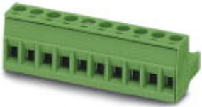
The figure shows a 10-pos. version of the product in green

PCB connector, nominal current: 12 A, number of positions: 9, pitch: 5 mm, connection method: Screw connection with tension sleeve, color: green, contact surface: Tin