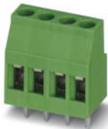
PCB terminal block, nom. voltage: 400 V, pitch: 5.08 mm, number of positions: 6, connection method: Screw connection with tension sleeve, mounting: Wave soldering, color: green

Please be informed that the data shown in this PDF Document is generated from our Online Catalog. Please find the complete data in the user's documentation. Our General Terms of Use for Downloads are valid ( http://phoenixcontact.com/download )