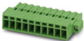
The figure shows an 10-position version

PCB connector, nominal current: 12 A, rated voltage (III/2): 320 V, number of positions: 8, pitch: 5.08 mm, connection method: Crimp connection, color: Pebble gray