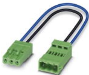
Assembled PCB connectors, 3-position, product feature: PCB connectors for Smart Meter Gateways (SMGW)

Please be informed that the data shown in this PDF Document is generated from our Online Catalog. Please find the complete data in the user's documentation. Our General Terms of Use for Downloads are valid ( http://phoenixcontact.com/download )