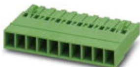
The figure shows an 10-position version

PCB connector, nominal current: 12 A, rated voltage (III/2): 320 V, number of positions: 3, pitch: 5.08 mm, connection method: Crimp connection, color: turquoise green, contact surface: Tin, Corresponding female crimp contacts with current [A] and conductor cross section range [mm 2 ] data: 10A/MSTBC-MT 0,5-1,0 (3190564); 10A/MSTBC-MT 0,5-1,0 BA (3190645); 12A/MSTBC-MT 1,5-2,5 (3190551); 12A/MSTBC-MT 1,5-2,5 BA (3190658). BA = Bandkontakte