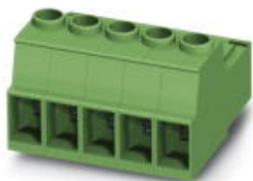
The figure shows a 5-pos. version of the product

PCB connector, number of positions: 2, pitch: 7.62 mm, color: yellow, contact surface: Tin