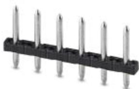
The figure shows a 6-position version

Pin strip, nominal current: 12 A, number of positions: 4, pitch: 5 mm, color: black, contact surface: Tin, The maximum current depends on the plug used. The lower of the two current values apply for plug and pin strip. The pin strip is made of highly temperature resistant plastic and is thus suitable for the reflow process.