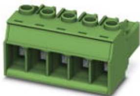
The figure shows a 5-pos. version of the product

PCB connector, nominal current: 41 A, number of positions: 2, pitch: 7.62 mm, connection method: Screw connection with tension sleeve, color: green, contact surface: Tin