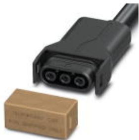
SUNCLIX micon mains connector for the plug side, 3-pos., IP67, 20 A, 600 V, trunk line: 1.0 m, incl. dust protection cap, North American version

Please be informed that the data shown in this PDF Document is generated from our Online Catalog. Please find the complete data in the user's documentation. Our General Terms of Use for Downloads are valid ( http://phoenixcontact.com/download )