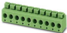
The figure shows the 10-position version

PCB terminal block, nominal current: 16 A, nom. voltage: 400 V, pitch: 5 mm, number of positions: 5, connection method: Push-in spring connection, mounting: Wave soldering, conductor/PCB connection direction: 0°, color: green