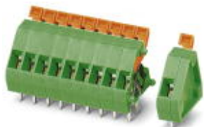
The figure shows the 10-position version

PCB terminal block, nom. voltage: 200 V, pitch: 3.81 mm, number of positions: 4, connection method: Spring-cage connection, color: green