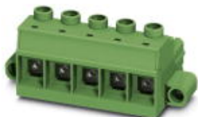
The figure shows a 5-pos. version of the product

PCB connector, nominal current: 125 A, rated voltage (III/2): 1000 V, number of positions: 4, pitch: 15 mm, connection method: Screw connection with tension sleeve, color: green, contact surface: Silver