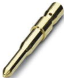
Crimp contact, turned, contact diameter: 1.5 mm, crimp range: 0.14 mm 2 ... 0.56 mm 2

Please be informed that the data shown in this PDF Document is generated from our Online Catalog. Please find the complete data in the user's documentation. Our General Terms of Use for Downloads are valid ( http://phoenixcontact.com/download )