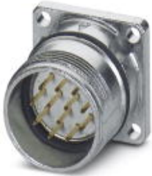
Device connector for front wall, straight, shielded: yes, Screw locking, M23, Radial O-ring, 4x Ø 3.2

Please be informed that the data shown in this PDF Document is generated from our Online Catalog. Please find the complete data in the user's documentation. Our General Terms of Use for Downloads are valid ( http://phoenixcontact.com/download )