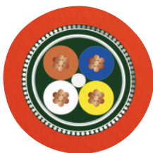
Sercos III [93K]