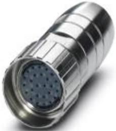
Contact carriers, M27, number of positions: 26, type of contact: Socket, Solder connection

Please be informed that the data shown in this PDF Document is generated from our Online Catalog. Please find the complete data in the user's documentation. Our General Terms of Use for Downloads are valid ( http://phoenixcontact.com/download )