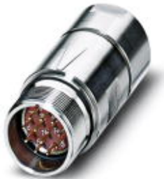
Coupler connector, straight, Screw locking, M23, number of positions: 17, type of contact: Pin, Crimp connection, shielded: yes, cable diameter range: 5 mm ... 13.2 mm

Please be informed that the data shown in this PDF Document is generated from our Online Catalog. Please find the complete data in the user's documentation. Our General Terms of Use for Downloads are valid ( http://phoenixcontact.com/download )