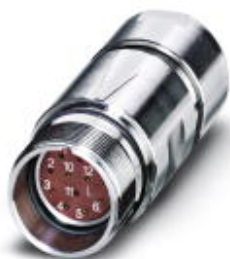
Coupler connector, straight, Screw locking, M23, number of positions: 12, type of contact: Socket, Crimp connection, shielded: yes, cable diameter range: 9 mm ... 13.2 mm

Please be informed that the data shown in this PDF Document is generated from our Online Catalog. Please find the complete data in the user's documentation. Our General Terms of Use for Downloads are valid ( http://phoenixcontact.com/download )