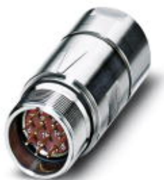
Coupler connector, straight, Screw locking, M23, number of positions: 12, type of contact: Pin, Crimp connection, shielded: yes, cable diameter range: 5 mm ... 13.2 mm

Please be informed that the data shown in this PDF Document is generated from our Online Catalog. Please find the complete data in the user's documentation. Our General Terms of Use for Downloads are valid ( http://phoenixcontact.com/download )