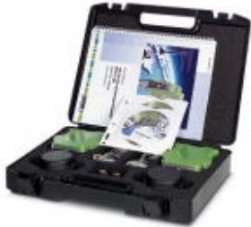
The figure shows a version of the article

Please be informed that the data shown in this PDF Document is generated from our Online Catalog. Please find the complete data in the user's documentation. Our General Terms of Use for Downloads are valid ( http://phoenixcontact.com/download )