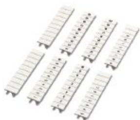
Zack marker strip, 10-section, horizontally labeled with the consecutive numbers: 471 ... 480, white, width: 5 mm

Please be informed that the data shown in this PDF Document is generated from our Online Catalog. Please find the complete data in the user's documentation. Our General Terms of Use for Downloads are valid ( http://phoenixcontact.com/download )