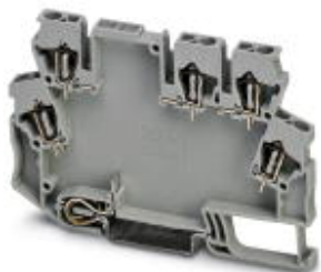
Housing fully equipped, with opening for LED and additional PE contact, 5-pos., color: Gray

Please be informed that the data shown in this PDF Document is generated from our Online Catalog. Please find the complete data in the user's documentation. Our General Terms of Use for Downloads are valid ( http://phoenixcontact.com/download )