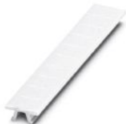
Zack marker strip, 10-section, vertically labeled with the consecutive numbers: 361 ... 370, white, width: 6 mm

Please be informed that the data shown in this PDF Document is generated from our Online Catalog. Please find the complete data in the user's documentation. Our General Terms of Use for Downloads are valid ( http://phoenixcontact.com/download )