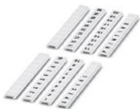
Zack marker strip flat, 10-section, horizontally labeled with the consecutive numbers: 311 ... 320, white

Please be informed that the data shown in this PDF Document is generated from our Online Catalog. Please find the complete data in the user's documentation. Our General Terms of Use for Downloads are valid ( http://phoenixcontact.com/download )