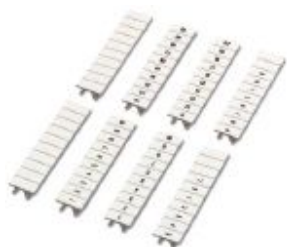
Zack marker strip, 10-section, horizontally labeled with the consecutive numbers: 301 ... 310, white, width: 5 mm

Please be informed that the data shown in this PDF Document is generated from our Online Catalog. Please find the complete data in the user's documentation. Our General Terms of Use for Downloads are valid ( http://phoenixcontact.com/download )