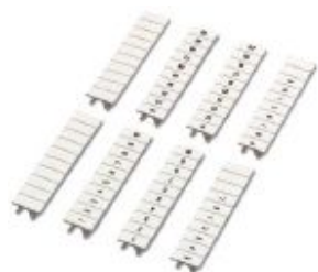
Zack marker strip, 10-section, vertically labeled with the consecutive numbers: 281 ... 290, white, width: 5 mm

Please be informed that the data shown in this PDF Document is generated from our Online Catalog. Please find the complete data in the user's documentation. Our General Terms of Use for Downloads are valid ( http://phoenixcontact.com/download )