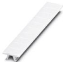
Zack marker strip, 10-section, horizontally labeled with the consecutive numbers: 151 ... 160, white, width: 6 mm

Please be informed that the data shown in this PDF Document is generated from our Online Catalog. Please find the complete data in the user's documentation. Our General Terms of Use for Downloads are valid ( http://phoenixcontact.com/download )