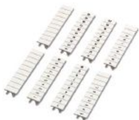
Zack marker strip, 10-section, horizontally labeled with the consecutive numbers: 141 ... 150, white, width: 5 mm

Please be informed that the data shown in this PDF Document is generated from our Online Catalog. Please find the complete data in the user's documentation. Our General Terms of Use for Downloads are valid ( http://phoenixcontact.com/download )