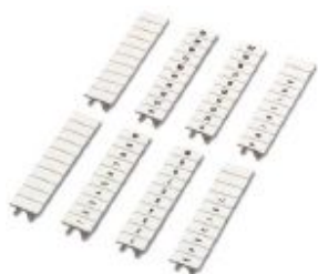
Zack marker strip, 10-section, vertically labeled with the consecutive numbers: 121 ... 130, white, width: 5 mm

Please be informed that the data shown in this PDF Document is generated from our Online Catalog. Please find the complete data in the user's documentation. Our General Terms of Use for Downloads are valid ( http://phoenixcontact.com/download )