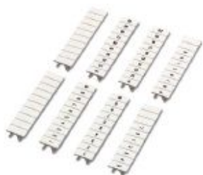
Zack marker strip, 10-section, horizontally labeled with the consecutive numbers: 71 ... 80, white, width: 5 mm

Please be informed that the data shown in this PDF Document is generated from our Online Catalog. Please find the complete data in the user's documentation. Our General Terms of Use for Downloads are valid ( http://phoenixcontact.com/download )