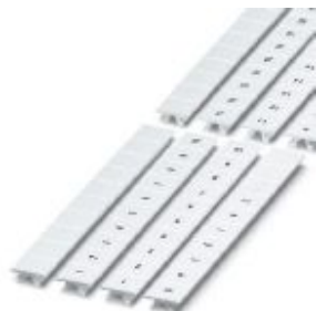
Zack marker strip, 10-section, horizontally labeled with the consecutive numbers: 51 ... 60, white

Please be informed that the data shown in this PDF Document is generated from our Online Catalog. Please find the complete data in the user's documentation. Our General Terms of Use for Downloads are valid ( http://phoenixcontact.com/download )