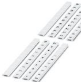
Zack marker strip flat, 10-section, horizontally labeled with the consecutive numbers: 51 ... 60, white

Please be informed that the data shown in this PDF Document is generated from our Online Catalog. Please find the complete data in the user's documentation. Our General Terms of Use for Downloads are valid ( http://phoenixcontact.com/download )