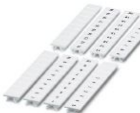
Zack marker strip, 10-section, horizontally labeled with the consecutive numbers: 41 ... 50, white, width: 6.5 mm

Please be informed that the data shown in this PDF Document is generated from our Online Catalog. Please find the complete data in the user's documentation. Our General Terms of Use for Downloads are valid ( http://phoenixcontact.com/download )