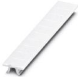
Zack marker strip, 10-section, horizontally labeled with the consecutive odd numbers: 41 ... 59, white, width: 6 mm

Please be informed that the data shown in this PDF Document is generated from our Online Catalog. Please find the complete data in the user's documentation. Our General Terms of Use for Downloads are valid ( http://phoenixcontact.com/download )