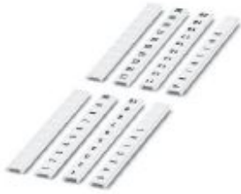
Zack marker strip flat, 10-section, vertically labeled with the consecutive numbers: 41 ... 50, white

Please be informed that the data shown in this PDF Document is generated from our Online Catalog. Please find the complete data in the user's documentation. Our General Terms of Use for Downloads are valid ( http://phoenixcontact.com/download )