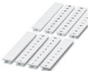
Zack marker strip, 10-section, horizontally labeled with the consecutive numbers: 31 ... 40, white, width: 6.5 mm

Please be informed that the data shown in this PDF Document is generated from our Online Catalog. Please find the complete data in the user's documentation. Our General Terms of Use for Downloads are valid ( http://phoenixcontact.com/download )