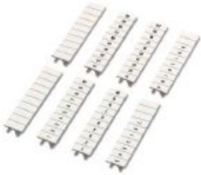
Zack marker strip, 10-section, horizontally labeled with the identical number: 18, white, width: 5 mm

Please be informed that the data shown in this PDF Document is generated from our Online Catalog. Please find the complete data in the user's documentation. Our General Terms of Use for Downloads are valid ( http://phoenixcontact.com/download )