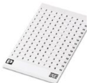
Marker card, self-adhesive, horizontally labeled with the consecutive numbers: 11 ... 20, 10-section marker strips with 14 identical decades, white

Please be informed that the data shown in this PDF Document is generated from our Online Catalog. Please find the complete data in the user's documentation. Our General Terms of Use for Downloads are valid ( http://phoenixcontact.com/download )