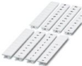
Zack marker strip, 10-section, horizontally labeled with the consecutive numbers: 1 ... 10, white, width: 6.5 mm

Please be informed that the data shown in this PDF Document is generated from our Online Catalog. Please find the complete data in the user's documentation. Our General Terms of Use for Downloads are valid ( http://phoenixcontact.com/download )