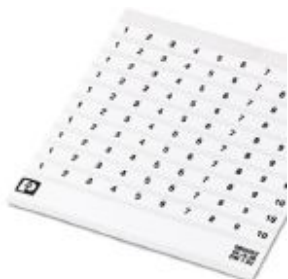
Marker card, self-adhesive, horizontally labeled with the consecutive numbers: 1 ... 10, 10-section marker strips with 10 identical decades, white

Please be informed that the data shown in this PDF Document is generated from our Online Catalog. Please find the complete data in the user's documentation. Our General Terms of Use for Downloads are valid ( http://phoenixcontact.com/download )