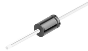
AXIAL LEAD (DO–35) CASE 017AG

Product parametric performance is indicated in the Electrical Characteristics for the listed test conditions, unless otherwise noted. Product performance may not be indicated by the Electrical Characteristics if operated under different conditions.