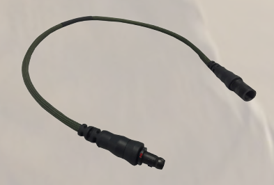
2M CONNECTOR BRAIDED CABLE NETWARRIOR ACCESSORY