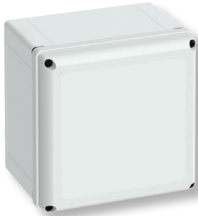
Cat No. 700-733 GEOS-L 3030-22-o with grey cover