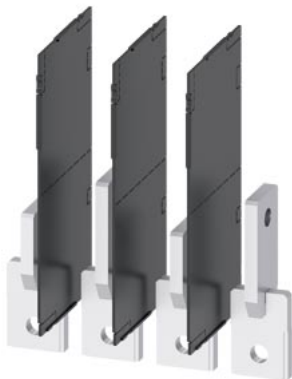
bus connector extended edgewise 4 units accessory for: 3VA1 400/630 3VA2 400/630