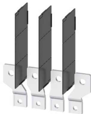
bus connector offset front 4 units accessory for: 3VA1 250