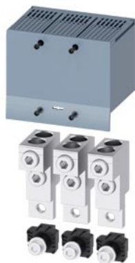
Wire connector TA2.3 2 x 25...150 mm 2 for 2 cables 3 units accessories for: 3VA2 100/160/250