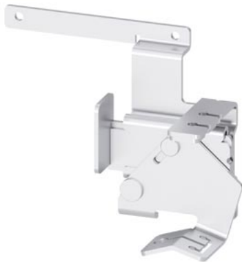
module for Bowden cable sliding bar accessory for: 3VA6 150/250