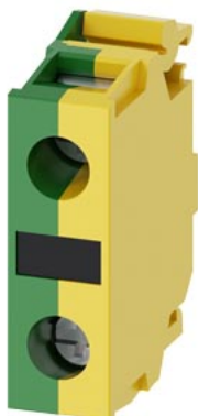
Support terminal, green/yellow, screw terminal, for floor mounting